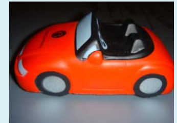
BC SPA Mustang

Plus receive these gifts from your Director at Team Celebration!