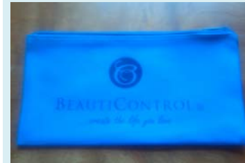
BeautiControl Money Bag

Plus Choose 1 $100 Spa Rewards Package (if you're a new Consultant in 1 st 3 months and your recruit is qualified)