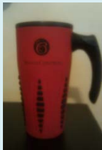
BeautiControl Travel Mug

Receive these gift from your Director at Team Celebration!